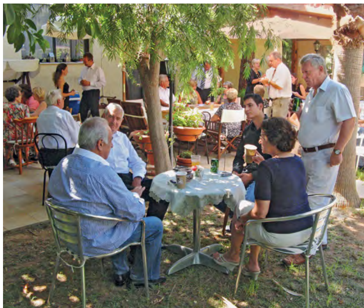
Members spend time together after a divine service in Limassol (Cyprus)