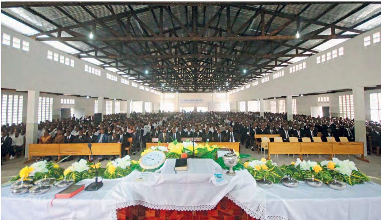
ENR RDC Sud-Est

Inside the new church. A total of 19,000 people have gathered in and around the building