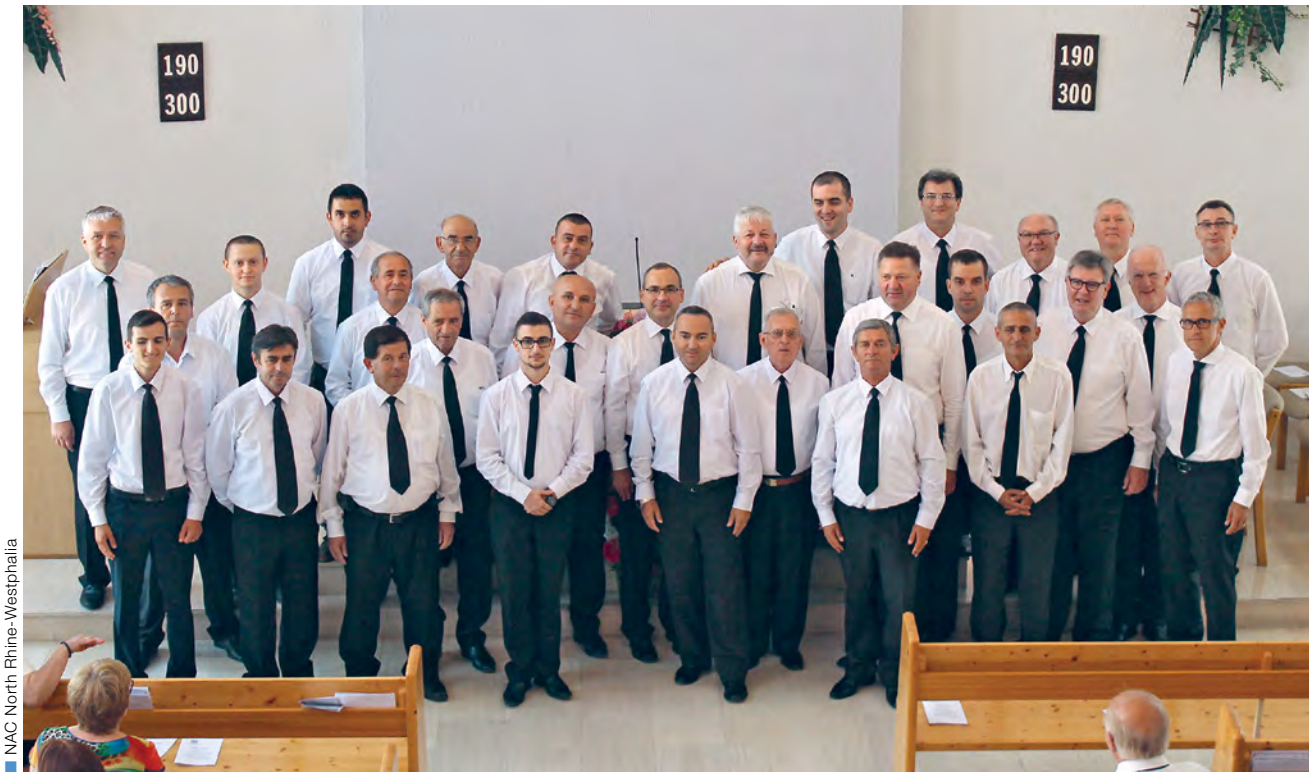
NAC North Rhine-Westphalia