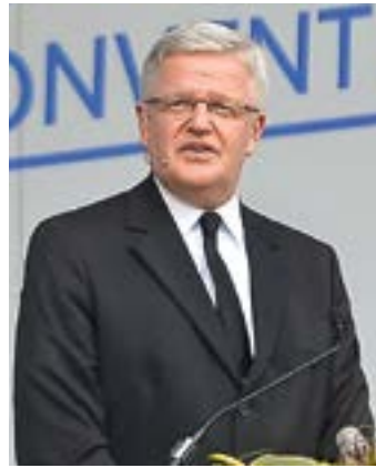
District Apostle Rüdiger Krause (Germany)