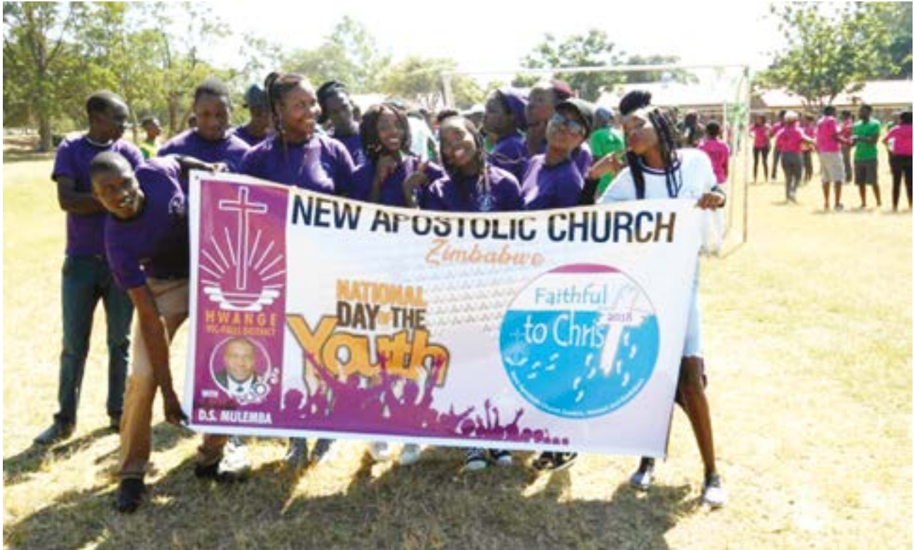
Part of the youths that participated in the 2018 National Day of Youths for Zimbabwe Apostle Area.