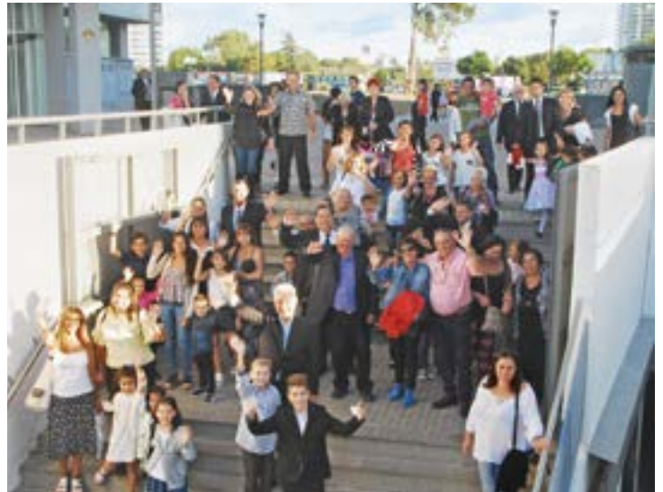
There was joy and excitement everywhere. It was the first time that the Chief Apostle visited this region of Argentina