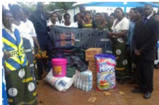
Some of the items donated to inmates at Luanshya Correctional Facility by the New Apostolic Church Sisters' fellowship.