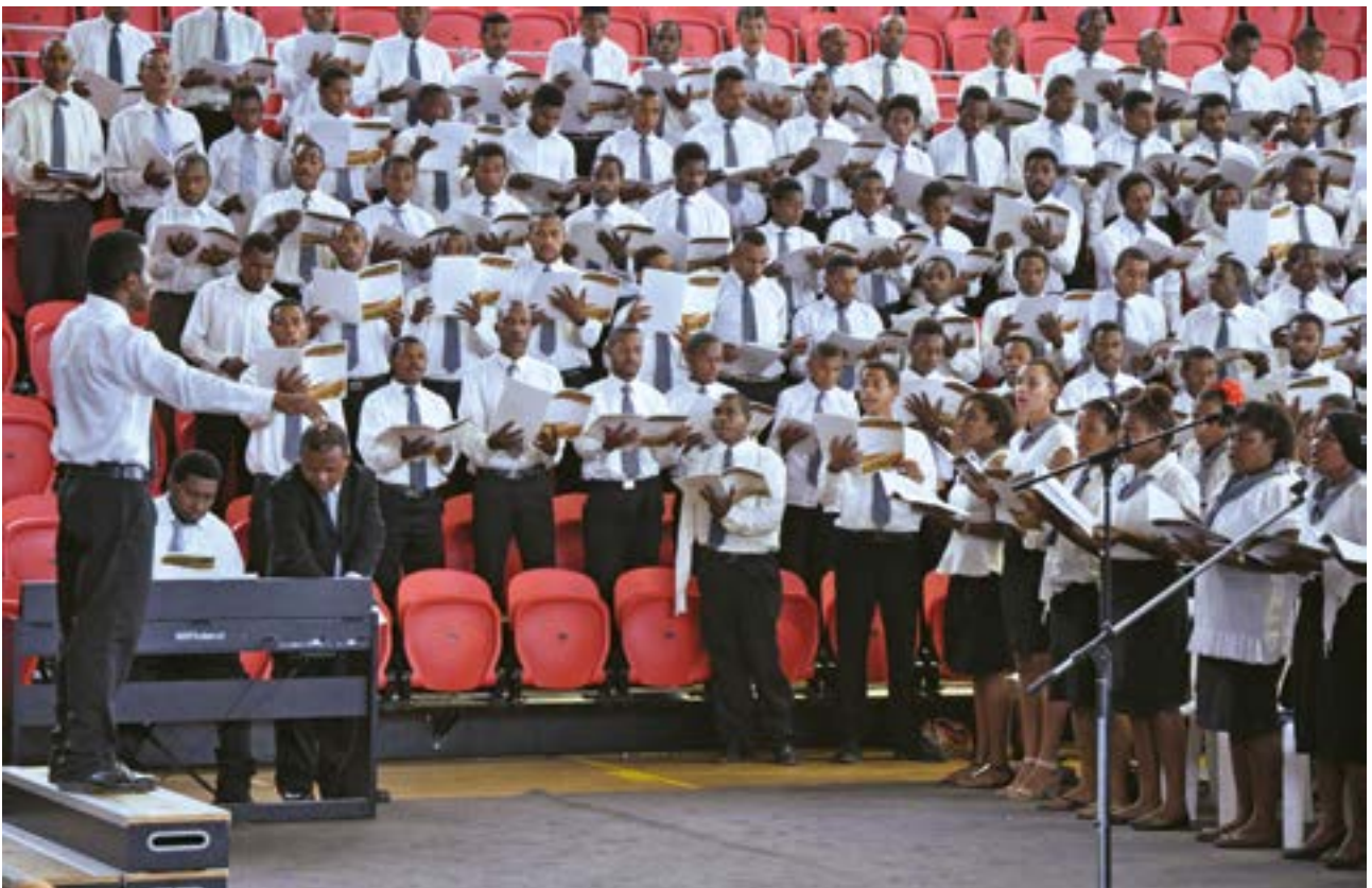
NAC Papua New Guinea

Giving thanks to God at all times for all things? Isn't that expecting a bit much? "It's unrealistic," Chief Apostle Jean-Luc Schneider says, and goes on to explain what is really meant. Following are core thoughts from a divine service he held on 1 October 2017 in Port Moresby in Papua New Guinea.