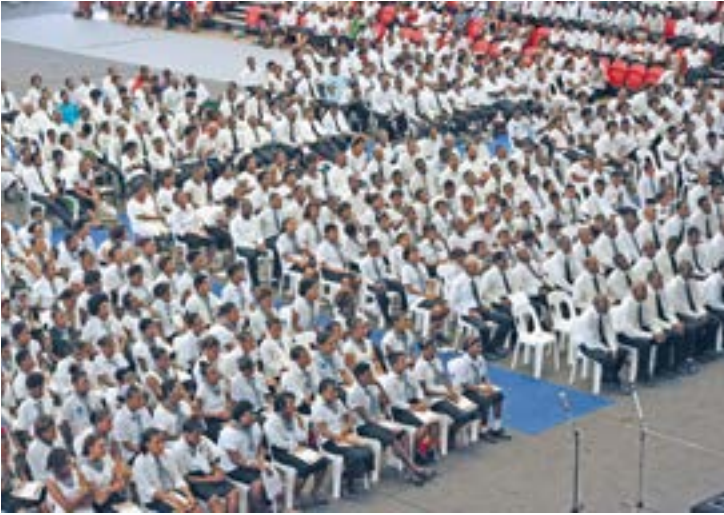
Nearly 1,600 people attended the divine service in Port Moresby. It took place at the Sir John Guise Indoor Complex