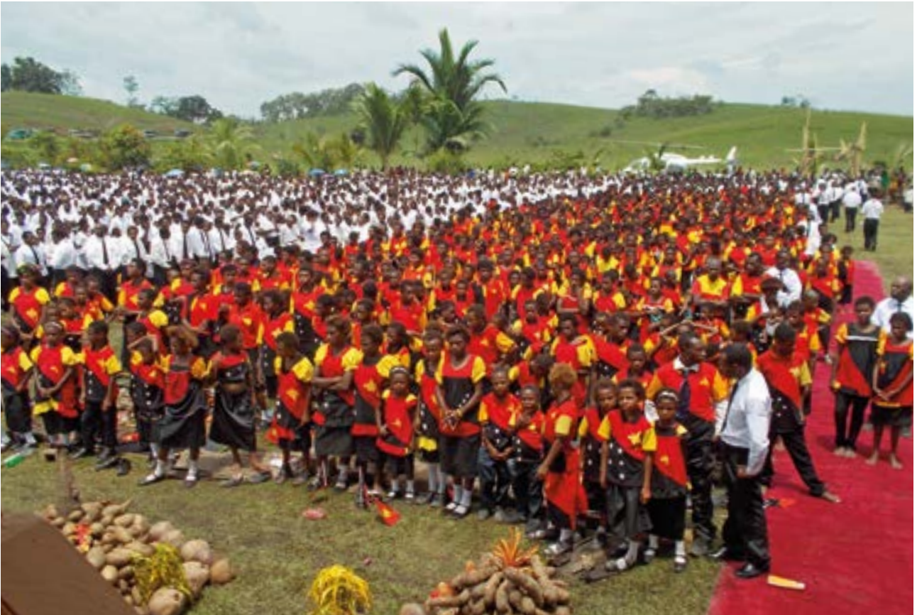
Many people walked up to seven days to attend the service. In order to provide food for all the visitors, the congregations planted additional crops already months before. They also built shelters

appropriate care, and not only think about ourselves. Even if we do not have too much, we believe that God always gives us enough so that we can help our neighbour in need.