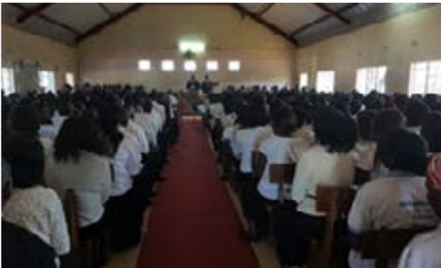
Part of the congregation during the Easter service at Dambwa congregation on April 1, 2018.

The Apostle read a text word from John 19:30. In this service, the Apostle confirmed 144 young brothers and sisters. At the end of the service, the Apostle watched presentations on doctrinal subjects by the Confirmed youths who