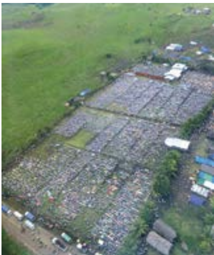
More than 24,000 people participated in the Thanksgiving service in Kombikum (Papua New Guinea)

God not only gives us a minimum, but an abundance so that we have enough to do good works