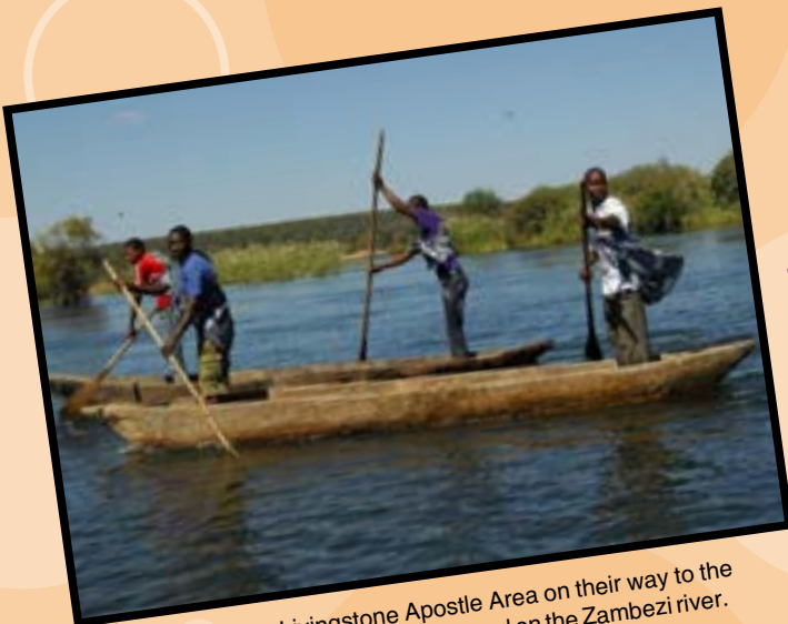
Youths from Livingstone Apostle Area on their way to the youth divine service at Mbufu island on the Zambezi river.