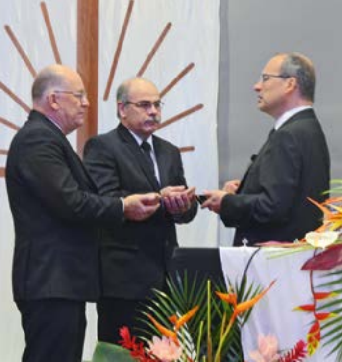
Over 400 believers gathered at the Holiday Inn in Natal (Rio Grande do Norte, Brazil) for the divine service celebrated by the Chief Apostle on 6 August 2017. His sermon was interpreted into Portuguese at the altar